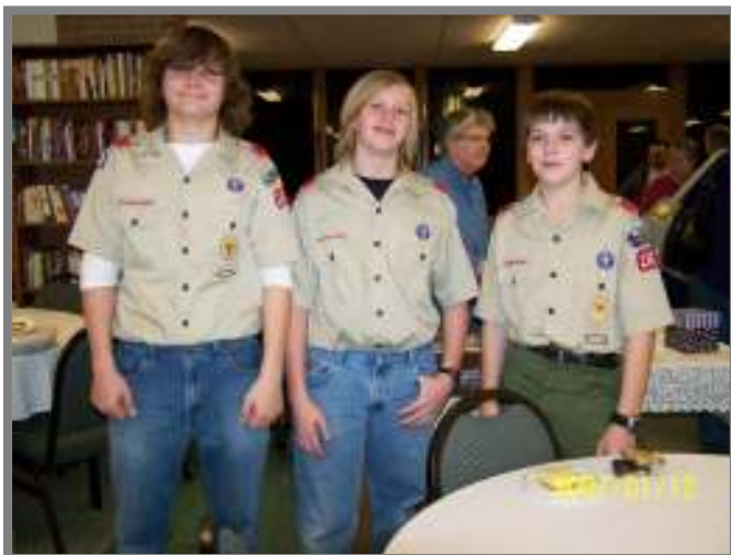
These Boy Scouts helped clear tables